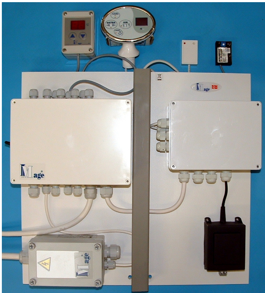
Electrical control panel.